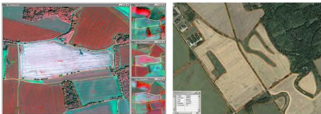
Example of the Common Agricultural Policy Controls with Remote Sensing

The Very High Resolution / Rapid Field Visit scenario: efficient, and independent from farmer