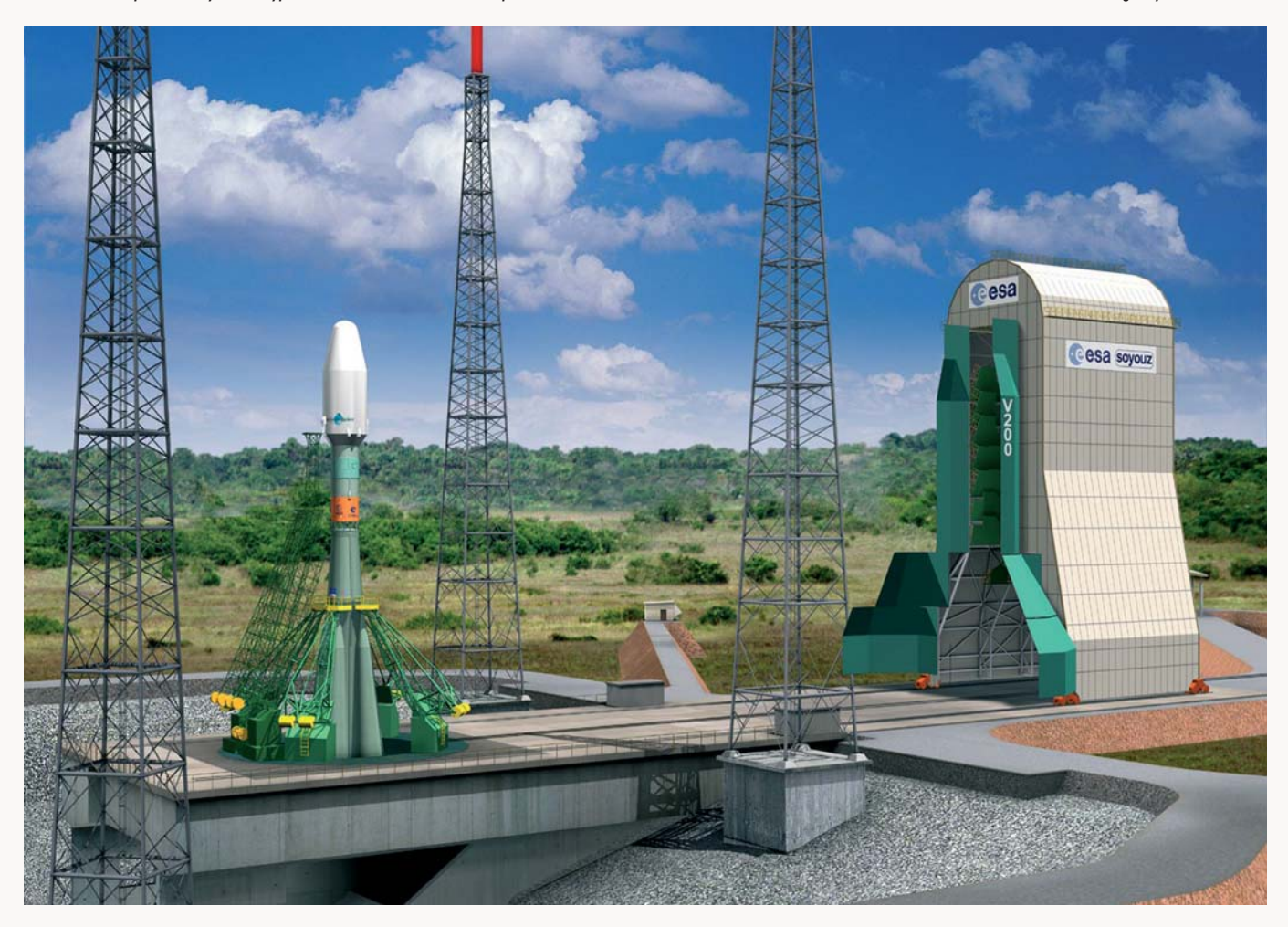
Below: the mobile gantry and launch table