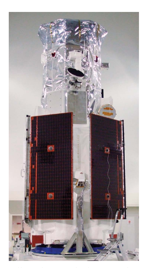
WorldView-2 clean room pre-launch preparations. The third of DigitalGlobe's state-of-the-art high-resolution commercial imagery satellites.