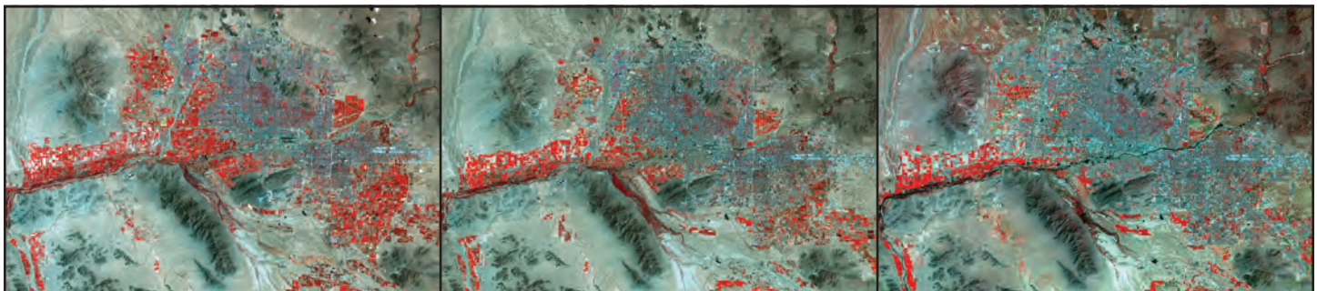
July 8, 1991 — Landsat 5